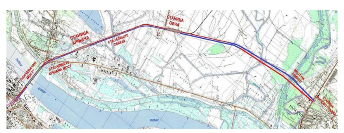
Figure 4: Route of the Pancevo Bridge - Pancevo Main section

The project for the construction of the second track of the Belgrade-Pancevo-Vrsac-state border railway, on the section Pancevo Bridge - Pancevo Main station in length of 14.86 km long, was completed in 2017 through a loan provided by the Russian Federation. Works were executed in amount of $89.9 million. The works included the construction of the second track, the right one from km 5 + 082.57 to km 15 + 882.72 and the left one from km 15 + 309.59 to km 19 + 562.73, as it is marked in blue in Figure 4. below.